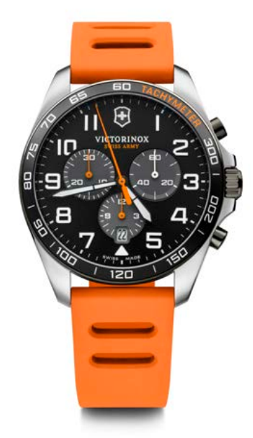
241893 ^{1} - FIELDFORCE SPORT CHRONO Ø 42 mm