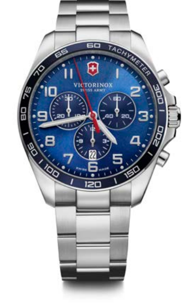
241901 - FIELDFORCE CLASSIC CHRONO Ø 42 mm