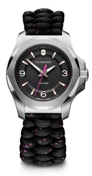
241918 - I.N.O.X V Ø 37 mm