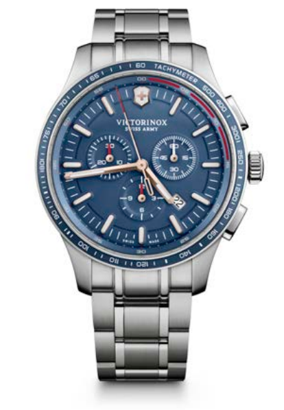
241817 - ALLIANCE SPORT CHRONO Ø 40 mm

Art. No. 241816, 241817 Movement analog quartz Movement Caliber Ronda 5030.D Case Material stainless steel Diameter 44 mm Lug width 21 mm