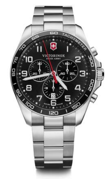
241899 - FIELDFORCE CLASSIC CHRONO Ø 42 mm