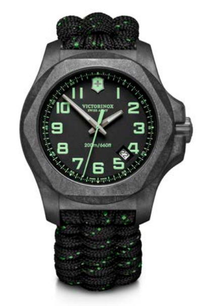
241859 - I.N.O.X CARBON Ø 43 mm