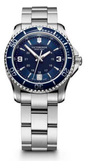
241609 - MAVERICK SMALL Ø 34 mm