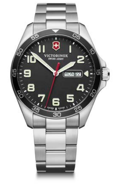
241849 - FIELDFORCE Ø 42 mm