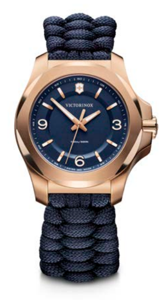
241955 * - I.N.O.X V Ø 37 mm