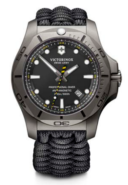
241812 - I.N.O.X PROFESSIONAL DIVER TITANIUM Ø 45 mm