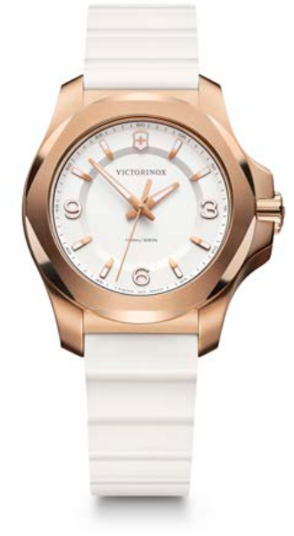
241954 * - I.N.O.X V Ø 37 mm