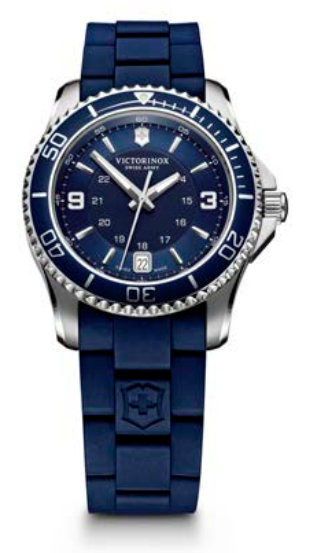
241610 - MAVERICK SMALL Ø 34 mm

Art. No. 241609, 241610 Movement analog quartz Movement Caliber Ronda 705 Case Material stainless steel Diameter 34 mm Lug width 18 mm