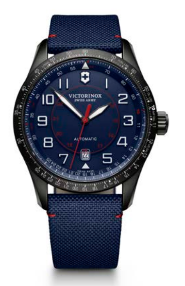
241820 * - AIRBOSS MECHANICAL Ø 42 mm