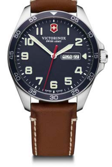
241848 - FIELDFORCE Ø 42 mm