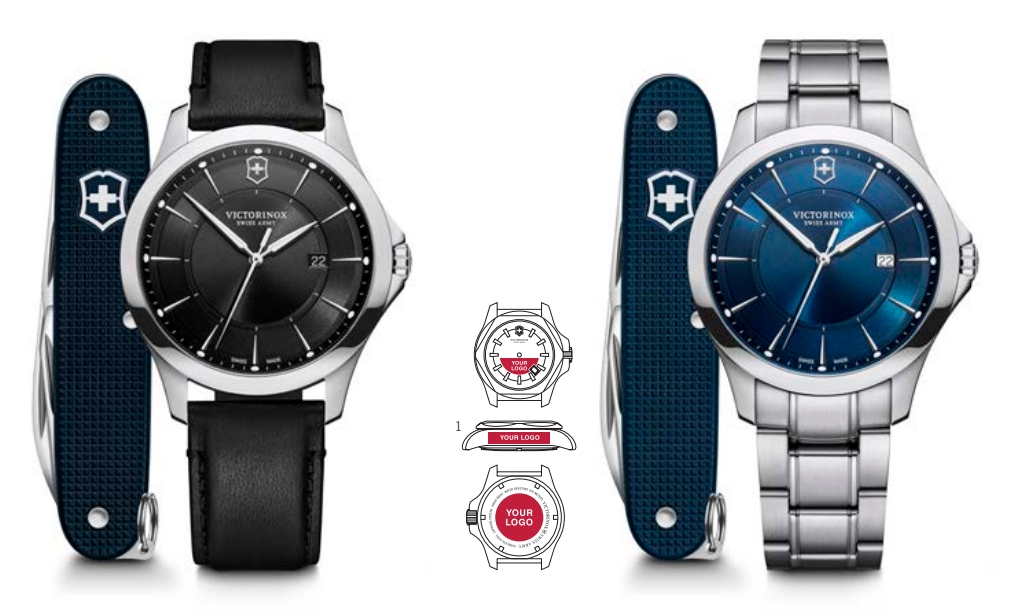
241904.1 */ ¹ - ALLIANCE Ø 40 mm