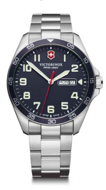
241851 - FIELDFORCE Ø 42 mm