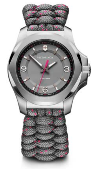
241920 - I.N.O.X V Ø 37 mm

Art. No. 241955, 241954, 241918, 241920, 241919, 241921