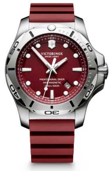
241736 - I.N.O.X PROFESSIONAL DIVER Ø 45 mm