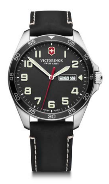
241846 - FIELDFORCE Ø 42 mm