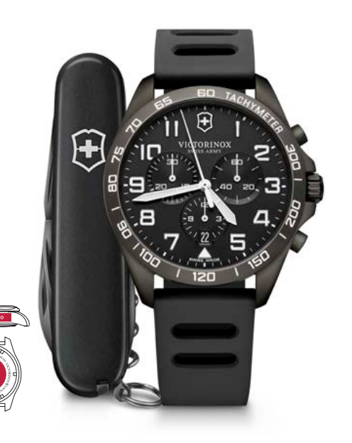
241926.1 */** - FIELDFORCE SPORT CHRONO Ø 42 mm

Art. No. 241889, 241891, 241893, 241926.1