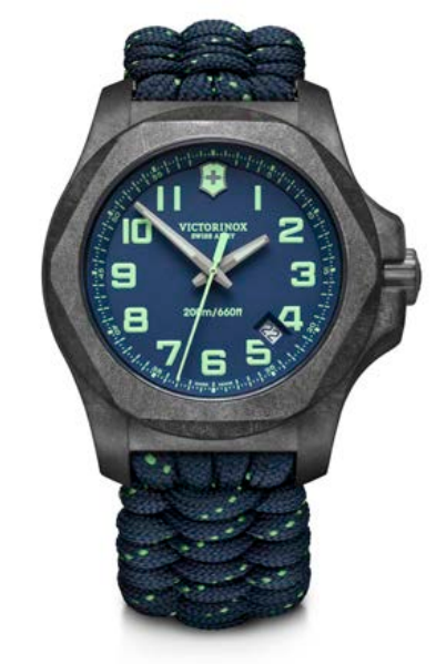
241860 - I.N.O.X CARBON Ø 43 mm