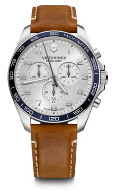
241900 - FIELDFORCE CLASSIC CHRONO Ø 42 mm