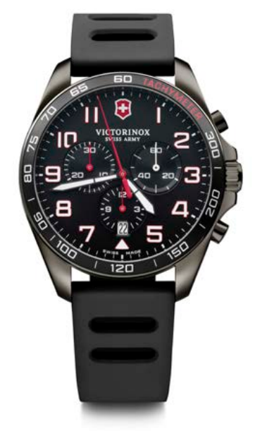
241889 * - FIELDFORCE SPORT CHRONO Ø 42 mm