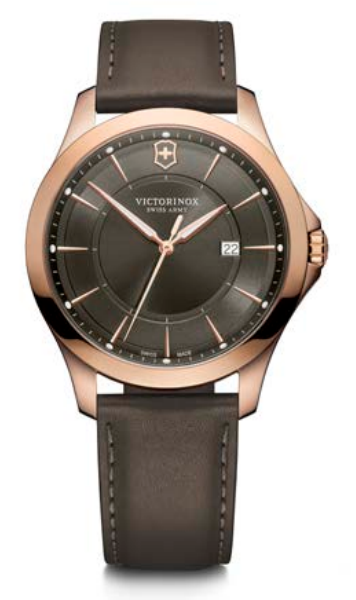
241908 ** - ALLIANCE Ø 40 mm