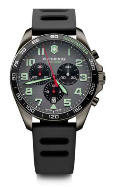
241891 * - FIELDFORCE SPORT CHRONO Ø 42 mm