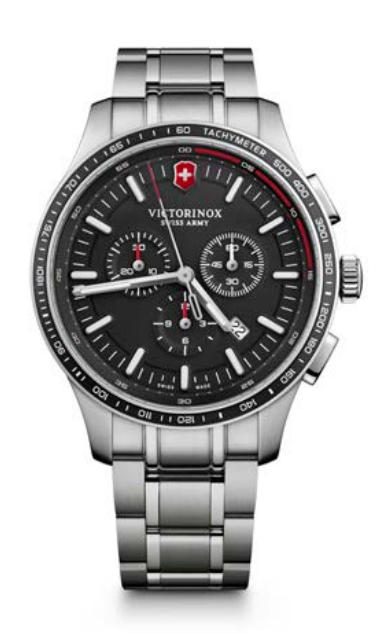
241816 - ALLIANCE SPORT CHRONO Ø 40 mm