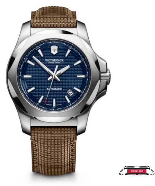
241834 - I.N.O.X MECHANICAL Ø 43 mm

Art. No.241682Movementanalog quartzMovement CaliberRonda 715Case Materialstainless steelDiameter43 mmLug width21 mm