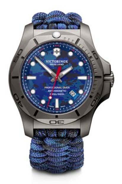
241813 - I.N.O.X PROFESSIONAL DIVER TITANIUM Ø 45 mm